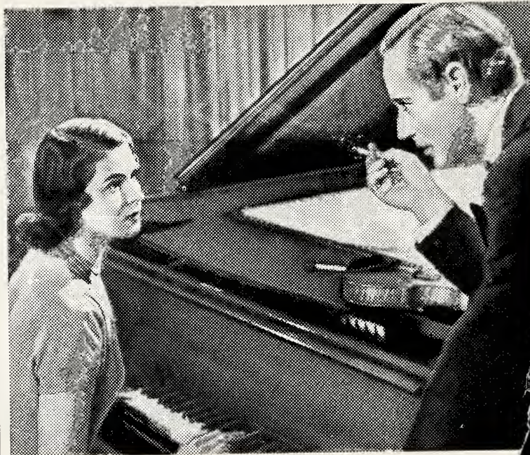
Mat 2A INGRID BERGMAN and LESLIE HOWARD in a scene from David O. Selznick's "INTERMEZZO," romantic film classic, which opens . . . at the . . . Theatre via Eagle Lion Films. Cecil Kellaway, Edna Best and Ann Todd head the supporting cast.

"Intermezzo" has won fame on two counts: it was Miss Bergman's first American film and it introduced the poignant title melody which is still popular.